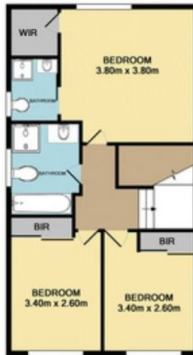
1ST FLOOR APPROX. FLOOR AREA 49.9 SQ.M. (537 SQ.FT.)

TOTAL APPROX. FLOOR AREA 127.6 SQ.M. (1373 SQ.FT.) Measurements are approximate. Not to Scale. For illustrative purposes only. Made with Metropix ©2015